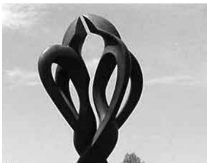
Wandell Sculpture Garden

Pieces in the Wandell Sculpture Garden dot the paths Meadowbrook Park's re-created tallgrass prairie. Works are on loan to the district from the artists, or have been purchased by the district or commissioned and are part of the permanent collection. New pieces are added regularly to this free outdoor gallery.