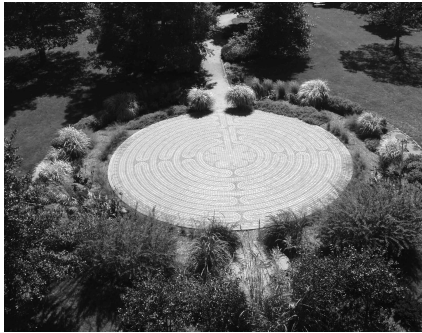
Crystal Lake Labyrinth

Koishikawa Garden is a product of a partnership between the Urbana Rotary Club and a sister Rotary club in Japan—Tokyo Koishikawa Rotary. The two clubs have donated money in their own cities for gardens that reflect traditional landscapes of the other club's country. The garden is in a transitional phase and it will soon become a dry, Japanese-themed garden. The new, minimalistic landscaping will still mimic the feel of a water garden even though there won't be any water present.