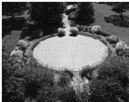
Crystal Lake Labyrinth

Koishikawa Garden is a product of a partnership between the Urbana Rotary Club and a sister Rotary club in Japan—Tokyo Koishikawa Rotary. The two clubs have donated money in their own cities for gardens that reflect traditional landscapes of the other club's country. The garden is in a transitional phase and it will soon become a dry, Japanese-themed garden. The new, minimalistic landscaping will still mimic the feel of a water garden even though there won't be any water present.