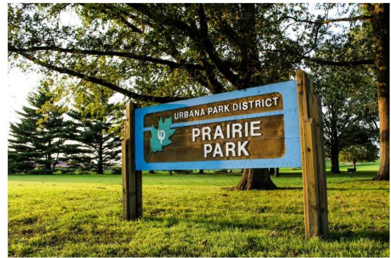
Urbana Park District invites the community to take an online survey to tell planners their thoughts about the future of the park district's outdoor courts, fields and amenities.