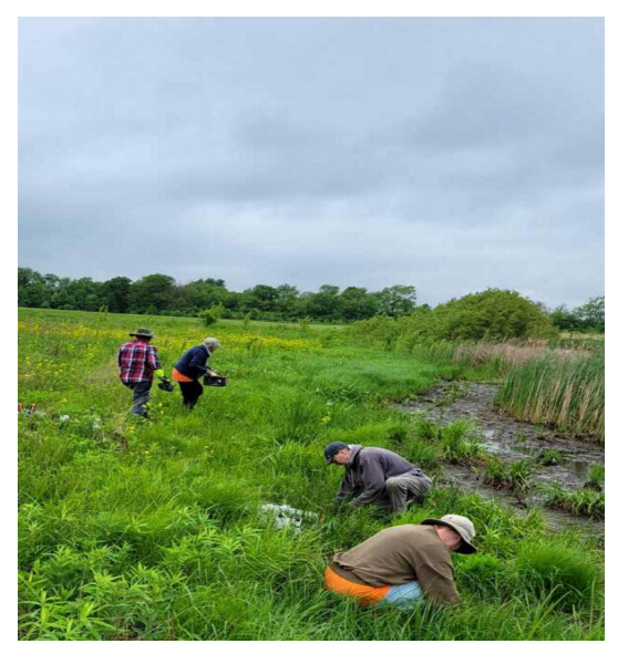
Master Naturalists at work in Weaver Park Wetland

The action items of the CARES Plan are separated into three categories, or 'pillars,' entitled: "Communicating Climate Action, Protecting & Strengthening Our Natural Environment, and Conserving Resources. Below are key examples of practices utilized and undertaken by the Urbana Park District and its community which coincide with each pillar. These items effectively demonstrate the significanct extent to which we are implementing our CARES Plan, and our commitment to Climate Action, Resilience, Education, and Sustainability through all our activities and endeavors.