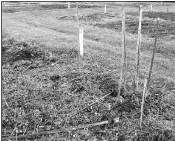
Large Plant Material Present