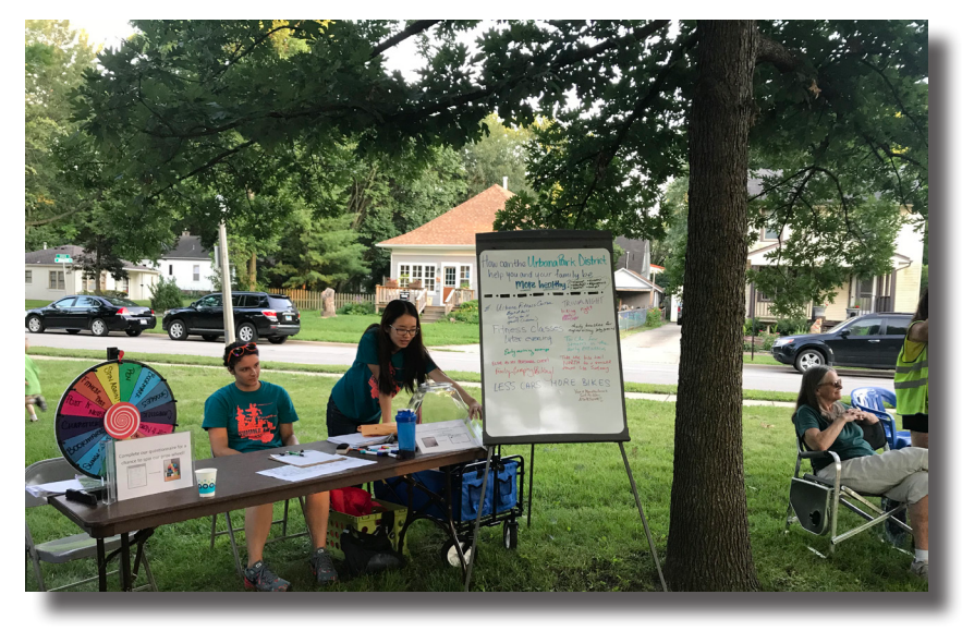
In July 2018 at Victory Park Neighborhood Night, park district interns administer the strategic plan questionnaire and help those who have finished it spin the prize wheel.