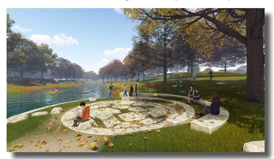
A rendering depicts a placemaking component of the Crystal Lake rehabilitation as visitors enjoy reading, relaxing, walking and kayaking near the stone plaza.

Topics of the Placemaking goals (beginning on page 13) include the revitalization of Crystal Lake, addition of active, teen and multigenerational opportunities for recreation, and creation of vibrant, comfortable, welcoming, art-filled spaces within parks.