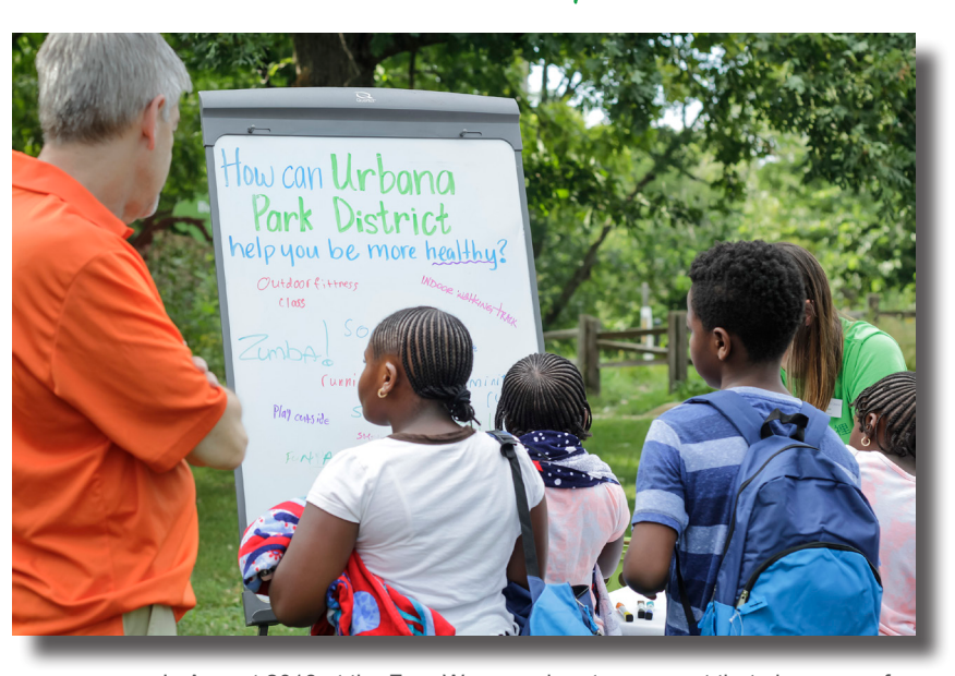
In August 2018 at the Free Wave pool party, an event that gives away free backpacks and school supplies, kids answer the white board question "How can the Urbana Park District help you be more healthy?" An Urbana Park District Advisory Committee member helps distribute prizes to those who answer.