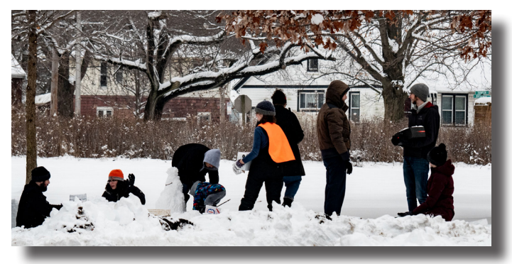
An example of being active in the cold winter months, the Snow Fort making pop up program engaged children and adults alike in outdoor activity.

Health & Wellness goals (beginning on page 16) highlight the need for more indoor and "on your own time" recreation opportunities, wellness for all generations, increased opportunities in colder months, and expanded partnerships with health agencies.