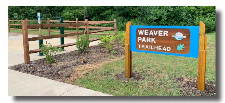
The Weaver Park Trailhead provides parking and amenities for community members looking to use both the 7-mile long Kickapoo Rail Trail as well as the nature paths through the Weaver Park prairie and wetland.

The focus of Trails & Connectivity goals (beginning on page 18) include the completion to trails master plan projects, connecting more people to trails and nature, promotion of the regional Kickapoo Rail Trail, and the preservation of existing hardscapes.