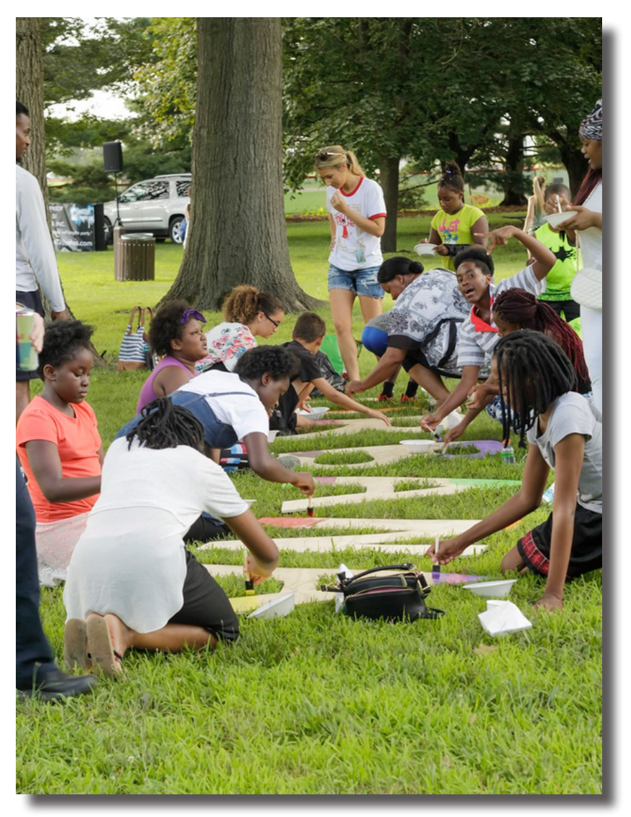
Community Program staff lead an art project to colorfully paint the letters U-R-B-A-N-A for an outdoor art installation at Prairie Park.

Additionally, the strategic plan will be reviewed by staff annually, in January, to assess which objectives have been met and which will be pursued in the coming year. After this review, an update will be provided to the Board of Commissioners. This plan is found online at www.urbanaparks.org/projects/. Check back as we update achievements over the next five years.