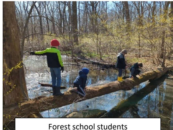
Forest school students