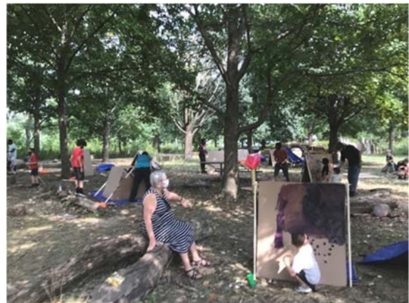
Fab Lab Fort Building